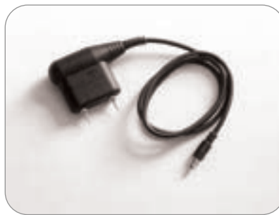
BLD5060 Heavy Duty 2-Pin Probe