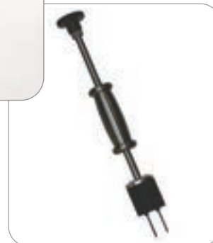
BLD5055 Heavy Duty Hammer Probe