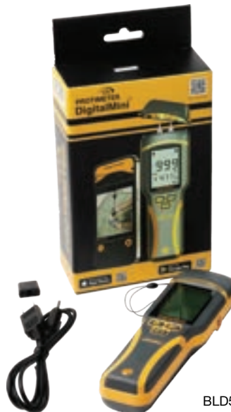
BLD5775 - Digital Mini Standard Kit